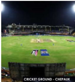
CRICKET GROUND - CHEPAUK