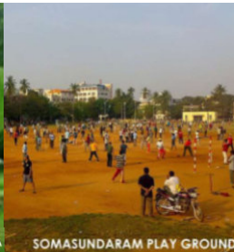
SOMASUNDARAM PLAY GROUND