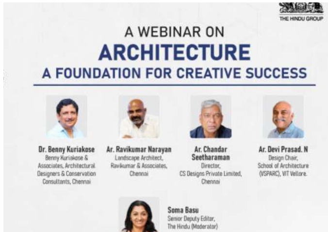
APR 2023 - Webinar on Architecture for VIT, Vellore.