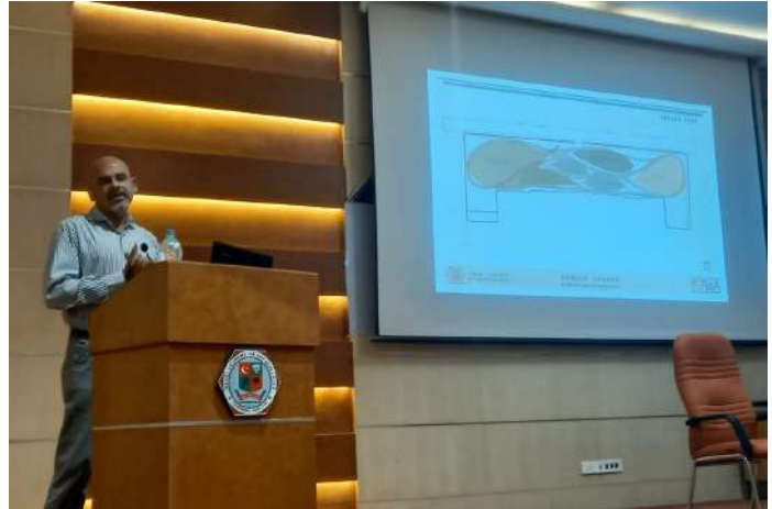
OCT 2022 - Guest Lecture at Measi Academy of Architecture, Chennai.