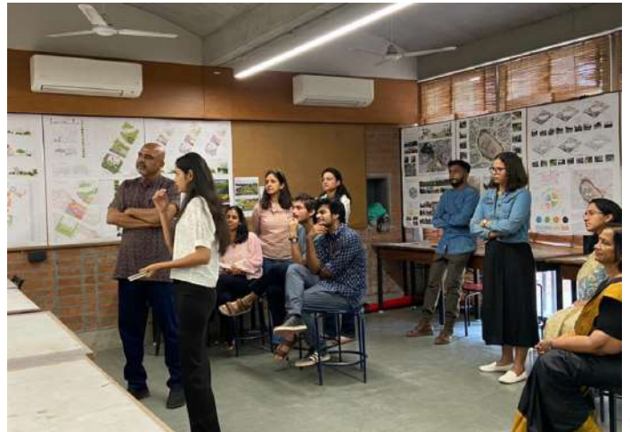
NOV 2023 - Jury Sessions at CEPT University, Ahmedabad.