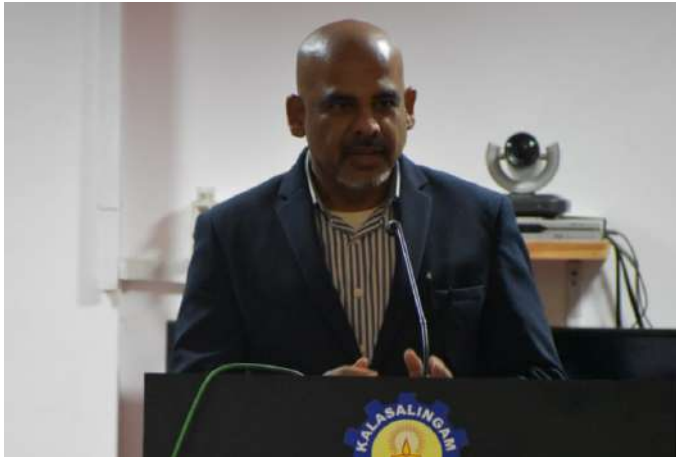
SEP 2022 - Guest Lecture at Kalasalingam Academy of Research and Education, Krishnan Koil.